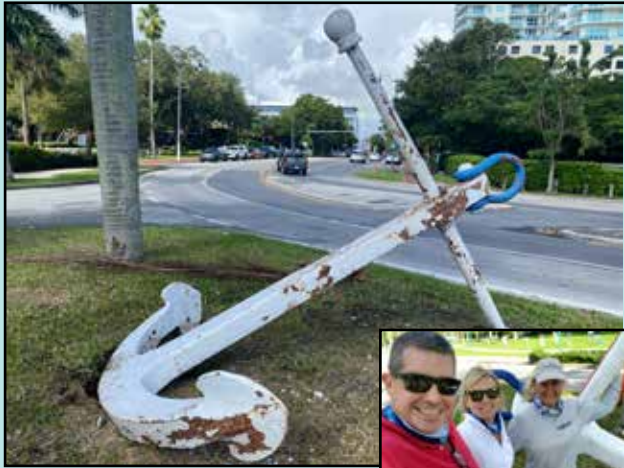
The iconic anchor before and after the great work of club members.