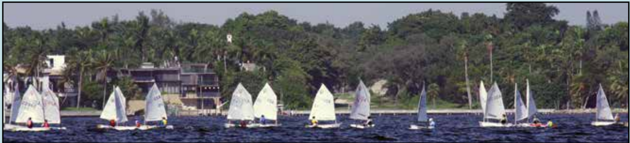
Green fleet was a long way from the photographer so we did the best we could.