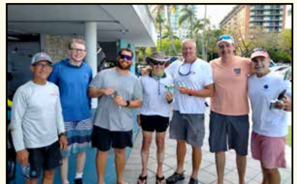
Finns and Sunfish Participants